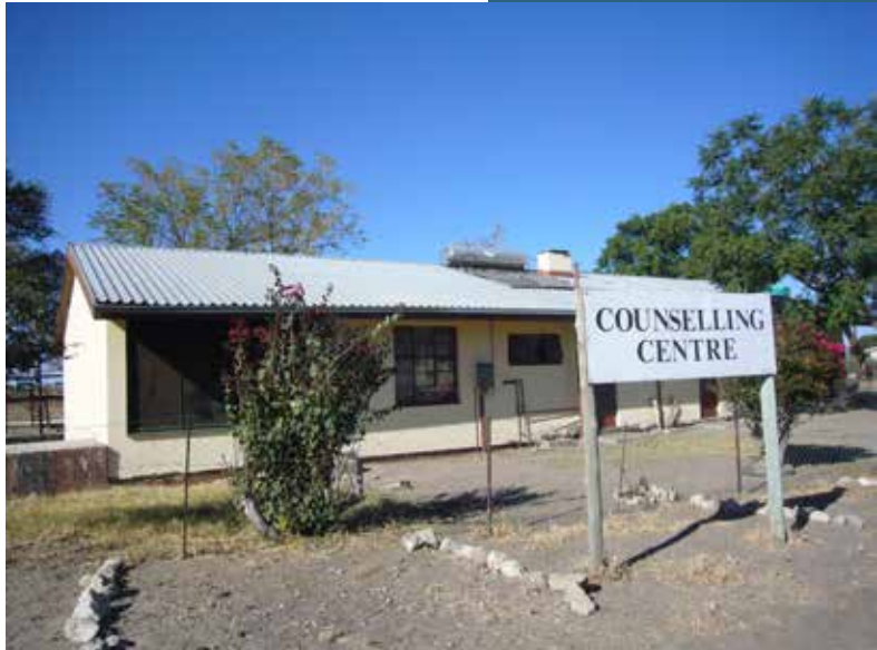
Counseling center formerly Aids- now Corona counseling