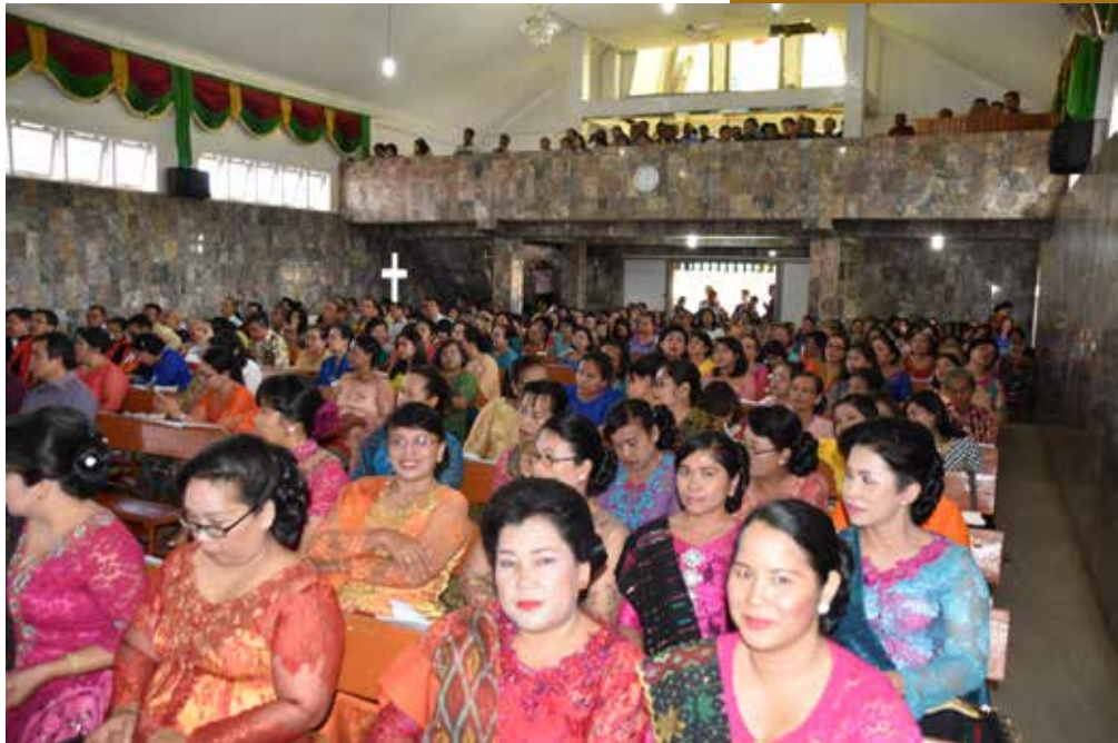
Visitors of a church service in Padangsidempuan