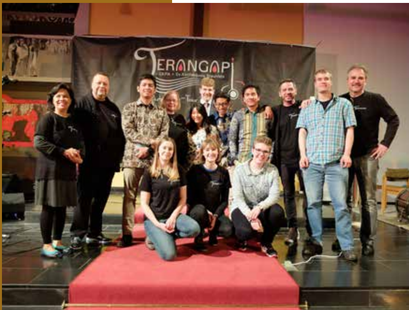
Guests and hosts after the concert of the band Terangapi in Wetzlar

The GKPA strives to maintain a good relationship with the Muslim majority by inviting state and municipal representatives such as the regent and the mayor to its own festivals and gatherings. In addition, members of the GKPA are involved in interreligious dialogue. People talk to each other. This is the custom among the Batak.