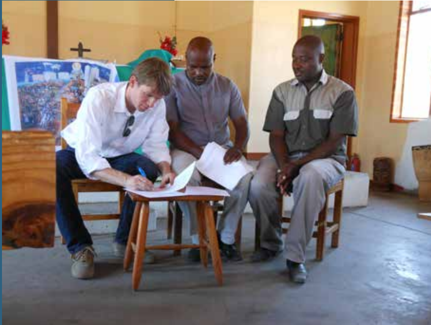
Partnership agreement 2011 – 2021

Our partnership with the Evangelical Lutheran Church in Botswana began as a result of an initiative of the synod in 1983, which on a proposal of the UEM was looking for international partners and was thereupon referred to Botswana.