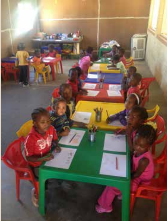
Day Care Center: Children, educator, visitors

The partnership between the church district of Wetzlar and the church district of Windhoek / Namibia exists since 1980. At that time, against the background of apartheid in South Africa and Namibia, the district synod decided to start this partnership in order to better understand and support the people. Since Namibia's independence in 1990, there have been many opportunities for encounter, exchange and common ecumenical learning. Our churches and countries are very different, but in our faith we are united. The actions and encounters are organized for the congregations in the church district by the Namibia Committee. In the following, we present the partnership work in highlights: