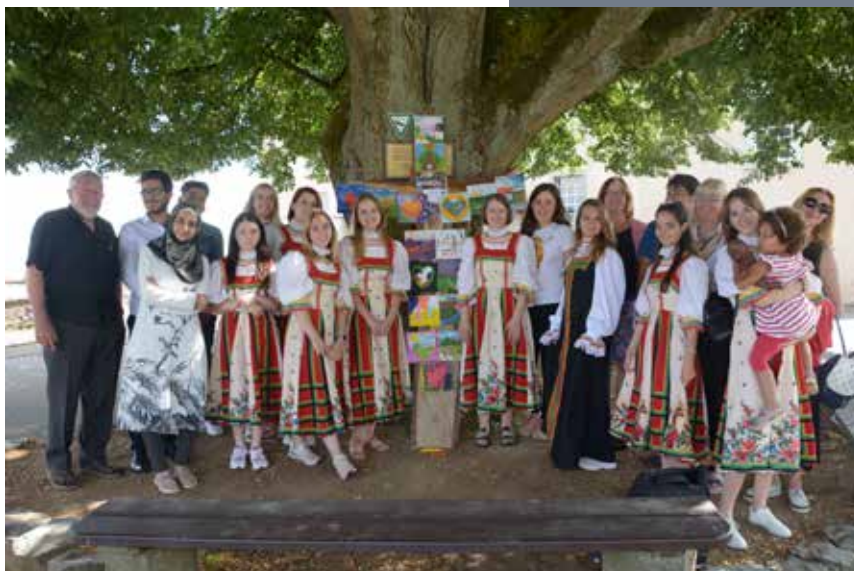
German-Russian group at the „Peace Festival“ in Greifenstein 2019