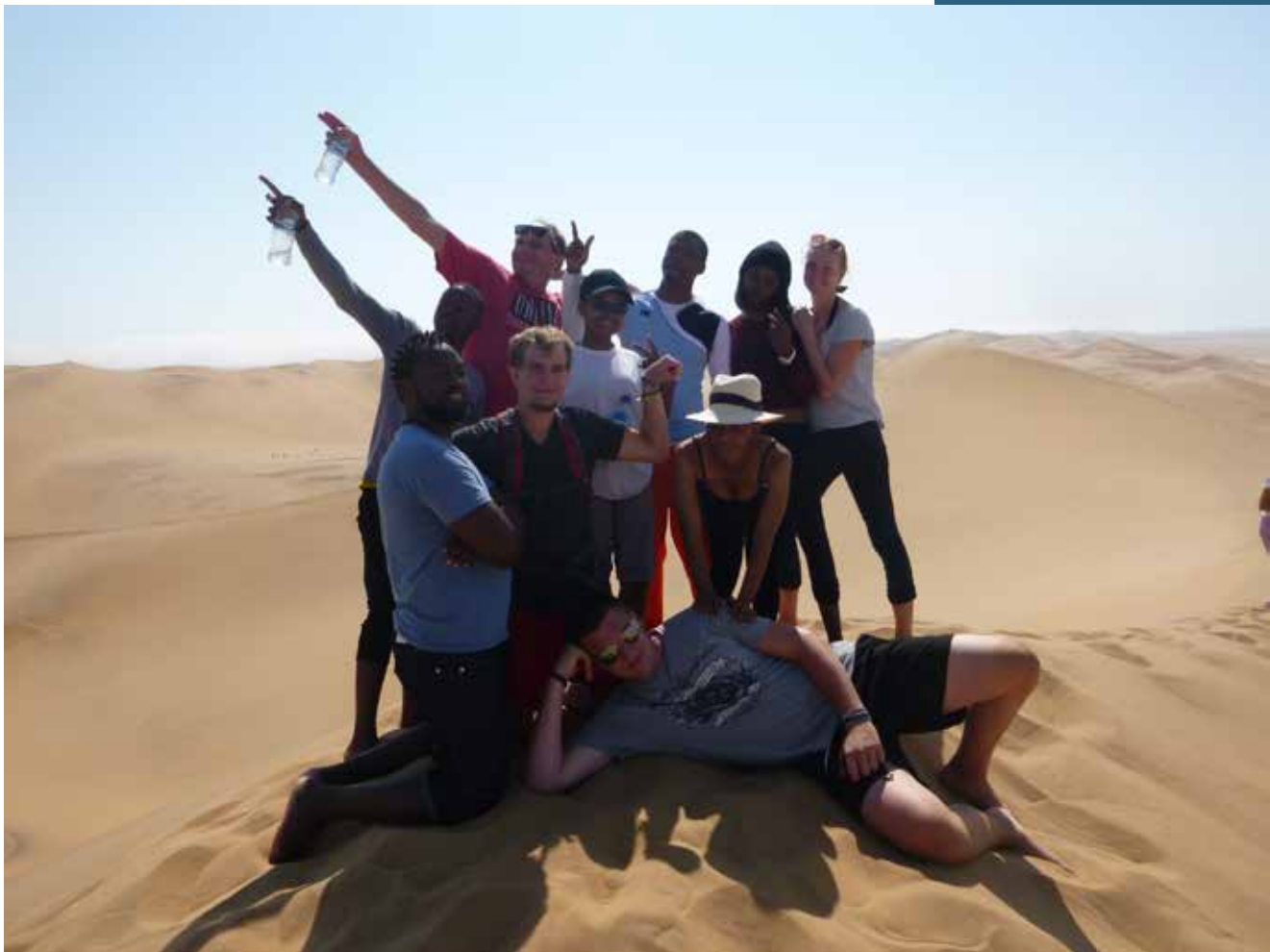
Youth encounter 2017