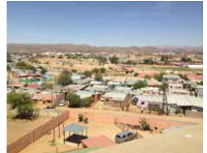
View from Okuryangawa to Katutura

The partnership between the church district of Wetzlar and the church district of Windhoek / Namibia exists since 1980. At that time, against the background of apartheid in South Africa and Namibia, the district synod decided to start this partnership in order to better understand and support the people. Since Namibia's independence in 1990, there have been many opportunities for encounter, exchange and common ecumenical learning. Our churches and countries are very different, but in our faith we are united. The actions and encounters are organized for the congregations in the church district by the Namibia Committee. In the following, we present the partnership work in highlights: