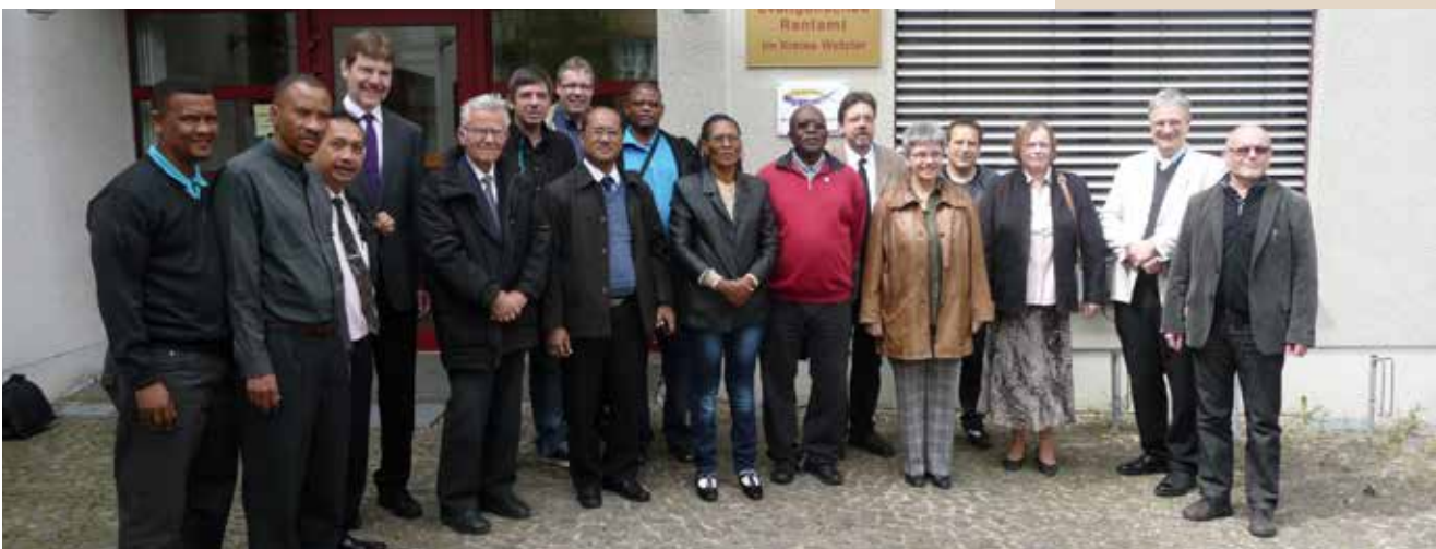
Encounter: People from Namibia and Germany 2013