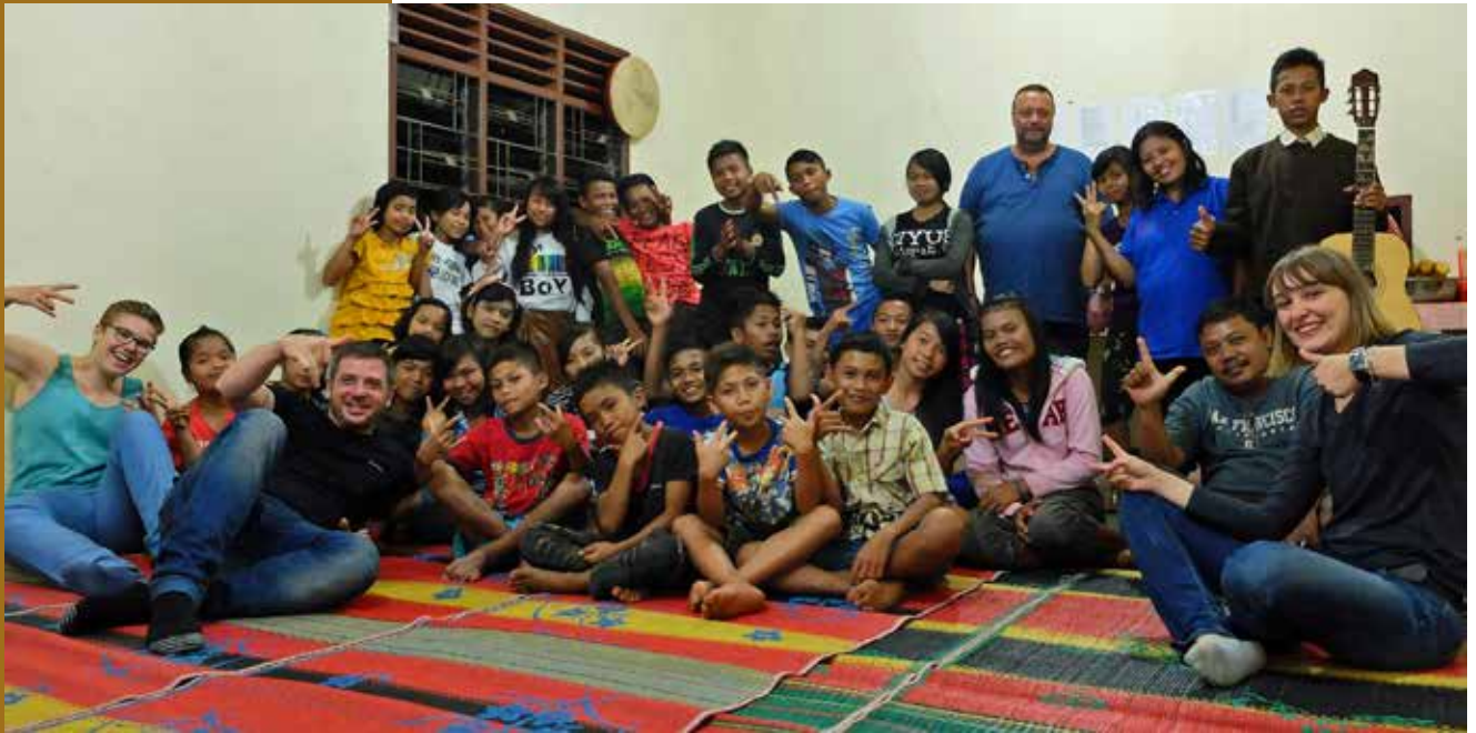
Representatives of the district church partnership visiting children and young people in the orphanage Deborah in Silangge

F or more than 30 years there has been a lively partnership of the smallest Indonesian Batak church, the GKPA (Christian Protestant Angkola-Batak Church) with our church district.