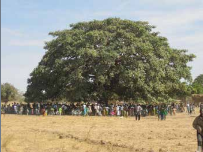
Fig tree by the dam